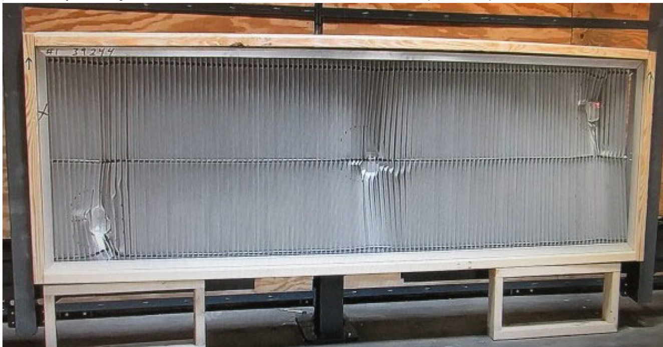
The AMCA International Listing Label applies to wind borne debris impact resistant louvers rated for 'Enhanced Protection.'